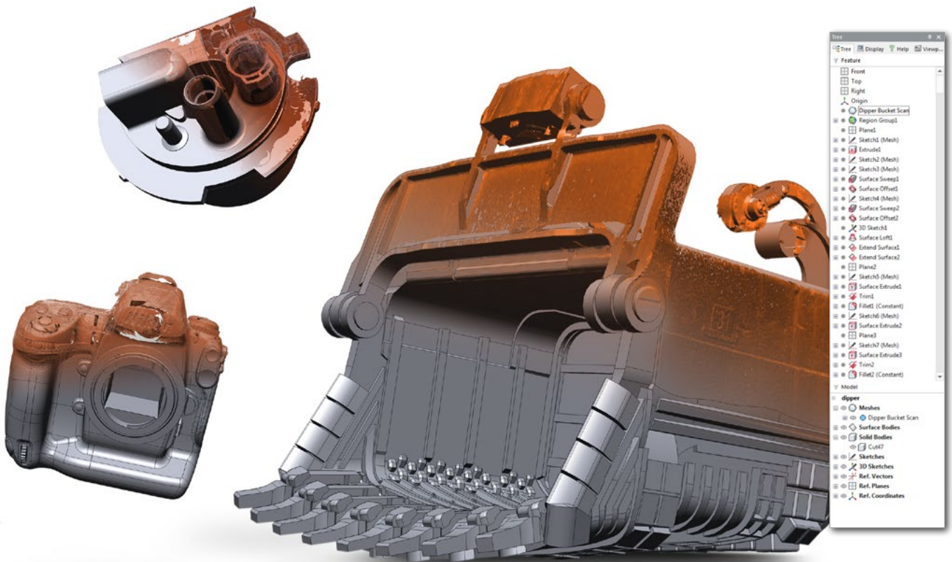
A parametric solid models created in Geomagic Design X

Save significant money and time when modeling as-built and as designed parts. Deform an existing CAD model to fit your 3D Scans. Reduce tool iteration costs by using actual part geometry to correct your CAD and elimination part springback problems. Reduce costly errors related to poor fit with other components.