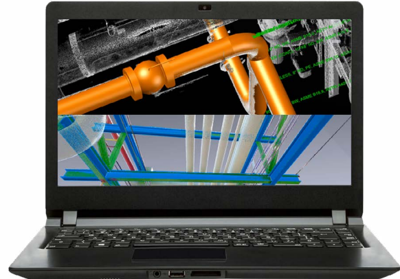
Reverse engineered piping system. Type recognition and best-fit of steel members

The photo like view of the scan data that is provided by PointSense allows a more intuitive navigation compared to a CAD environment.